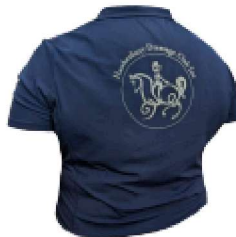
Shirt - $65