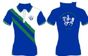
Polo - $60