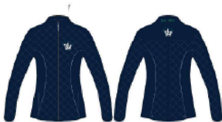
Jacket - $90

Strictly limited quantities available. Available for pickup or purchase at Festival.