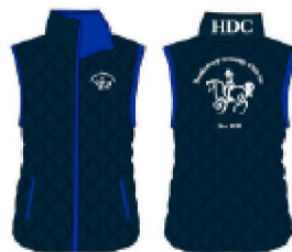
Vest - $85